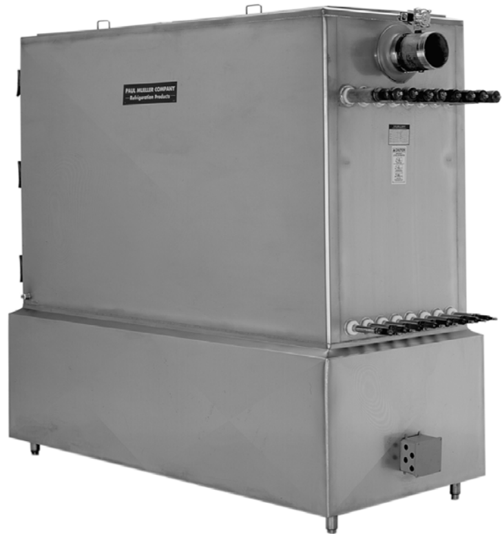
4 X 8 CHILLER SIZING CHART

Distribution pans are available in extra-low, low, and high flow rates, based on chilled water usage. Extra-low flow rates range from 6 to 16 gpm, low flow rates range from 13 to 24 gpm, and high flow rates range from 25 to 48 gpm (per evaporator).