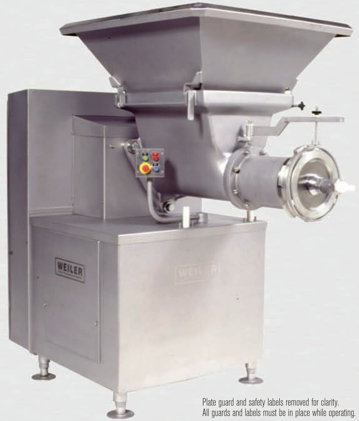
Plate guard and safety labels removed for clarity. All guards and labels must be in place while operating.

* Actual grind rate will depend on application specifications, including, but not limited to, reduction size, raw material and raw material temperature.