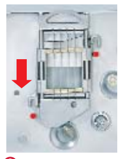
Improved gridset mounting system makes cleaning and changing easier.