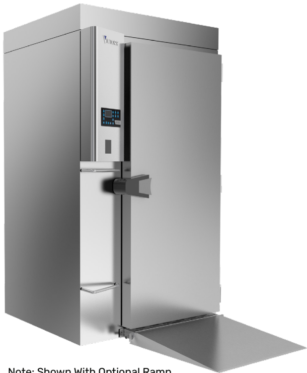
Note: Shown With Optional Ramp