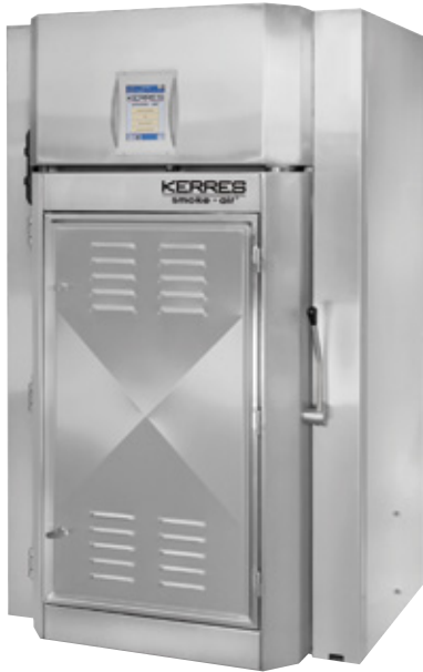
JS 1950 RET