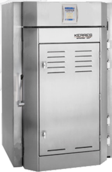
combined chamber 1600 RET-C