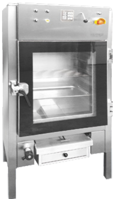
CS 350, semi-automatic