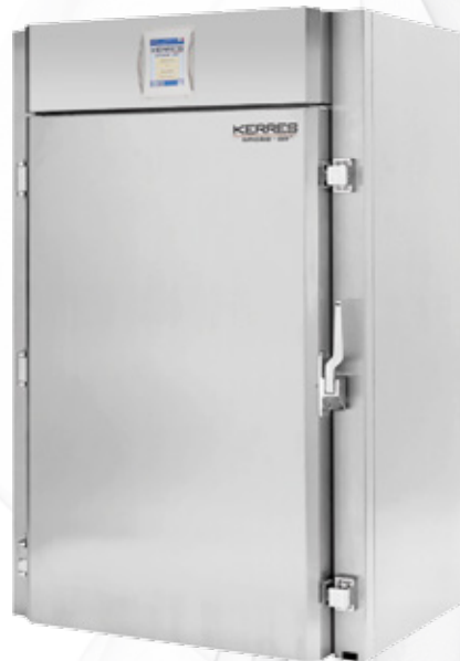
combined chamber 1900 EL-C-Q